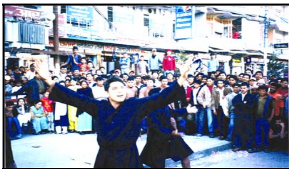
Promoting awareness through street dramas

In 2010, even after two years of the Peoples' Movement and Constituent Assembly (C.A) election, governments and political parties have not been able to address corruption, lack of accountability and transparency. In this transitional phase, attention has focused mostly on constitution framing, federalism, political supremacy, and formation of government. In absence of a strong political will, anti-corruption agenda has not received due priority.