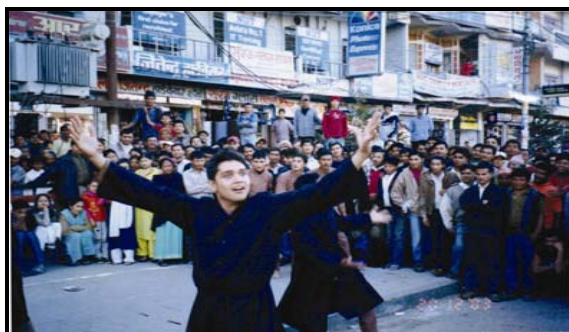
Promoting awareness through street dramas

During the last few years of political transition, governments and political parties have not been able to address issues related to corruption, lack of accountability and transparency. The transitional period has been a challenge for governance and anti-corruption agenda. Since all attention has remained on constitution framing and government formation, anti-corruption work has not received due priority. Hence, people, in general, perceive corruption to be on the rise in Nepal.